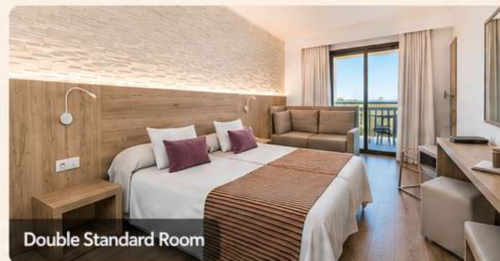
Double Standard Room