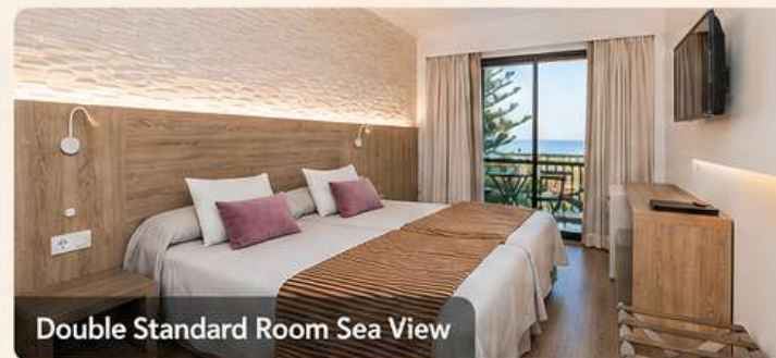
Double Standard Room Sea View