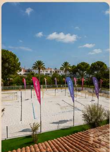
WORLD CLASS FACILITIES

Comfortable rooms, half-board buffet, pool, bar & all facilities you need.