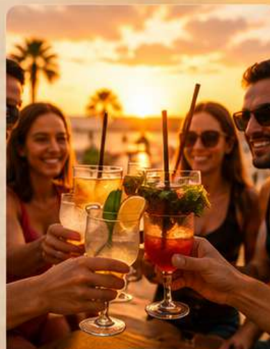
FUN & SOCIAL ATMOSPHERE

Players from around the world, united by beach volleyball, passion and good vibes.