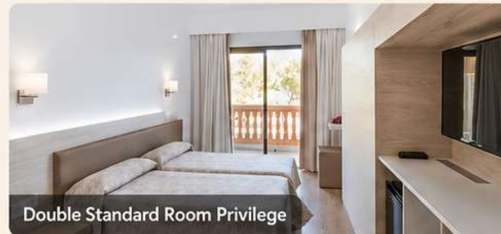
Double Standard Room Privilege